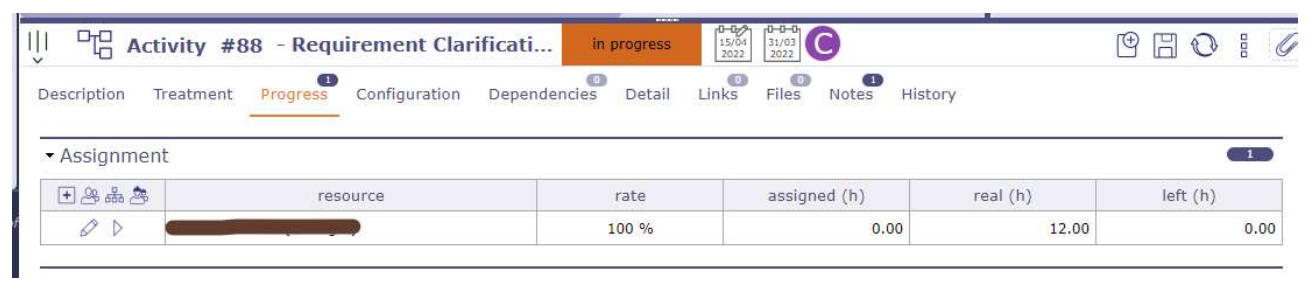
In Above Image assigned (h) & left (h) shows "0.00", real (h) shows "12.00"